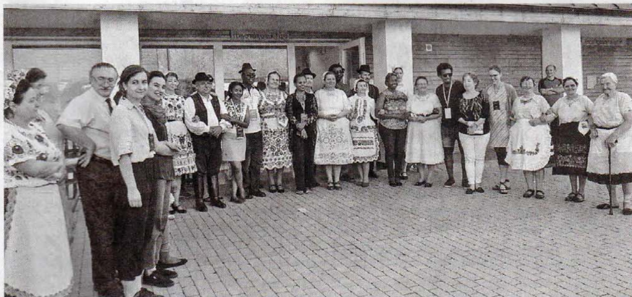
Az etióp delegáció tagjai remekül érezték magukat a Hagyományörzők Házában

vendégeket is a népviseletünk fogta meg a legjobban, ezért néhányukat felöltöztettek hagyományos kalocsaiba, és nem maradhatott el a rögtönzött táncház sem. Mint kiderült, más nemzetekhez képest rendkívül gyorsan sajátították el a lépéseket, ami feltehetően a kitűnő ritmusérzéküknek köszönhető, vélekedett, illetve annak, hogy a csapatban sokan eleve táncosok, a szentendrei programon bemutató Fendika táncegyüttes tagjai. A színekavalkádos ruházatok és a már-már arcpirító könnyedséggel megtanult táncok mellett a sajátos gasztronómiai remekeket értékelték a legjobban: a Hagyományörzők Háza becsinált levesssel és fánkkaal várta a vendégeket. G. J.