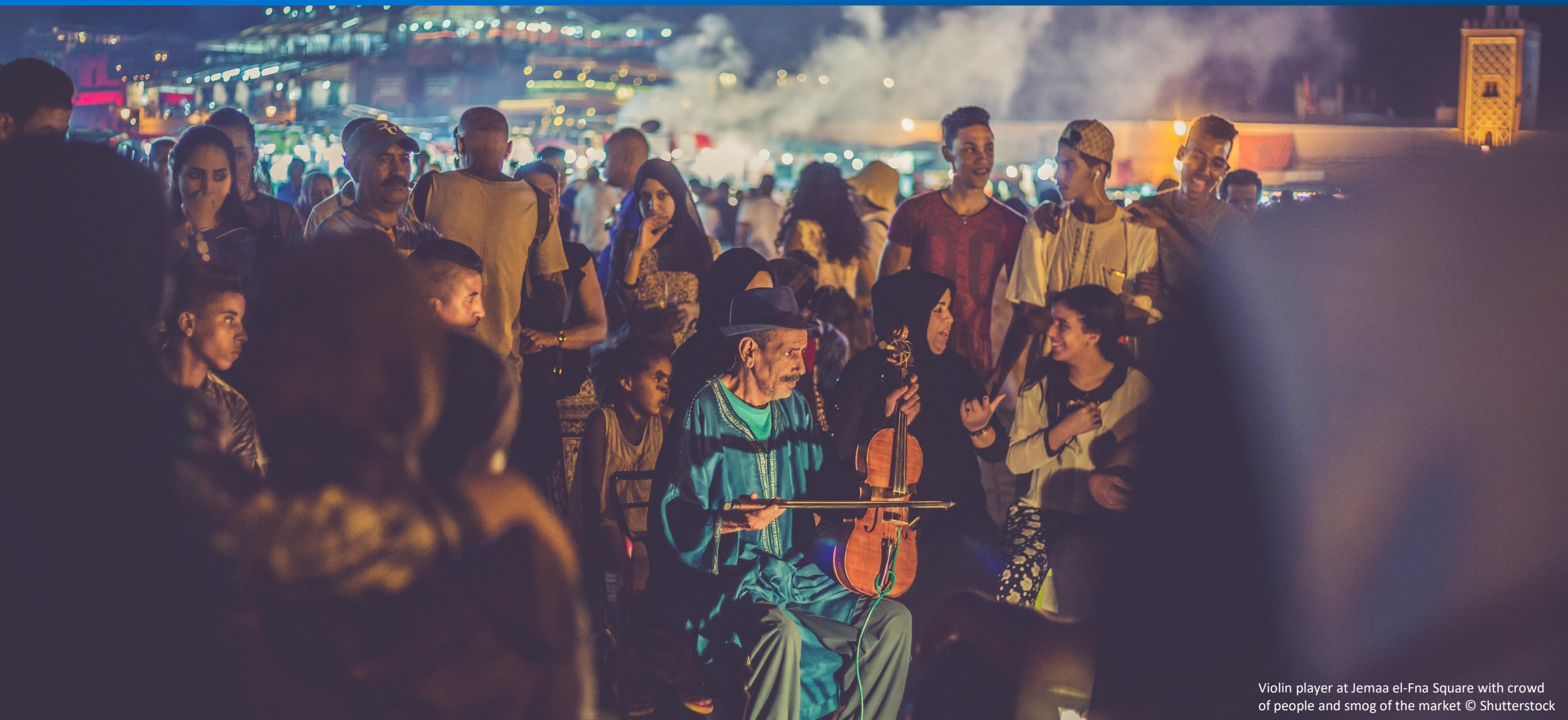
Violin player at Jemaa el-Fna Square with crowd of people and smog of the market